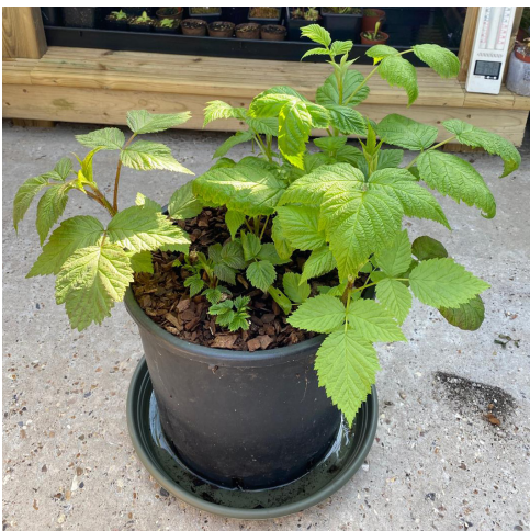
22nd April - 3g/L DCM applied

In 2024, it grew tall but only produced 4 raspberries on the entire plant. When the plant began to producing the first new shoots after winter, 3g/L of DCM Plant Based Feed was used to topdress and then a fresh layer of bark was placed on top.