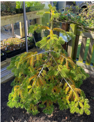
Before planting out with DCM

210 grams of DCM Plant Based Feed was incorporated with soil to fill the hole (equivalent to 3g/L of the original pot size)