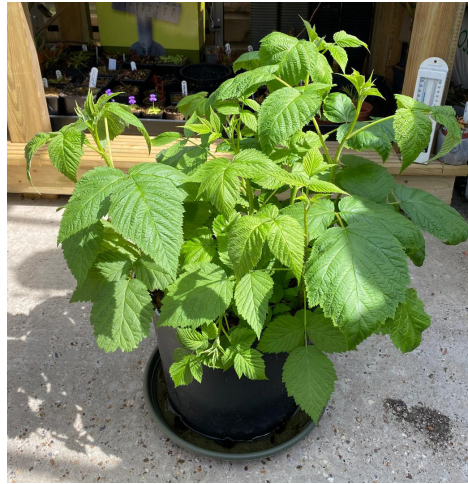
30th April - 8 days later

8 days after applying DCM Plant Based Feed as a topdress, the raspberry plant showed noticeable new growth which it had failed to show previously.