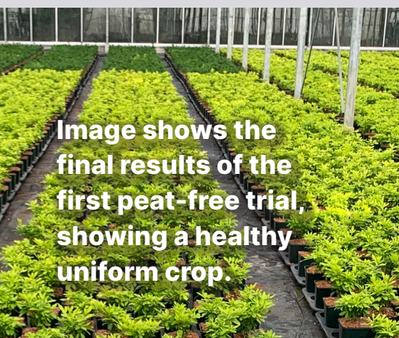
Image shows the final results of the first peat-free trial, showing a healthy uniform crop.