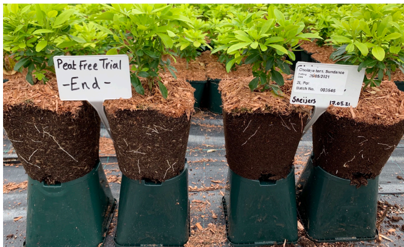
Image shows the peat free trial after 4 weeks compared to the traditional peat based growing medium, the results show the root development side by side with both mixes.