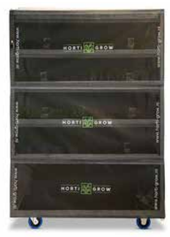
Full surround trolley jacket