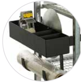
TOOL BOX FOR DANISH TROLLEY

Writing boards can be hooked between the two poles of a Danish trolley.