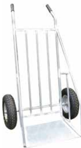
SACK TRUCK UP TO 85CM DIAMETER POT