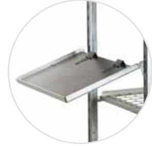
WRITING BOARD FOR DANISH TROLLEY