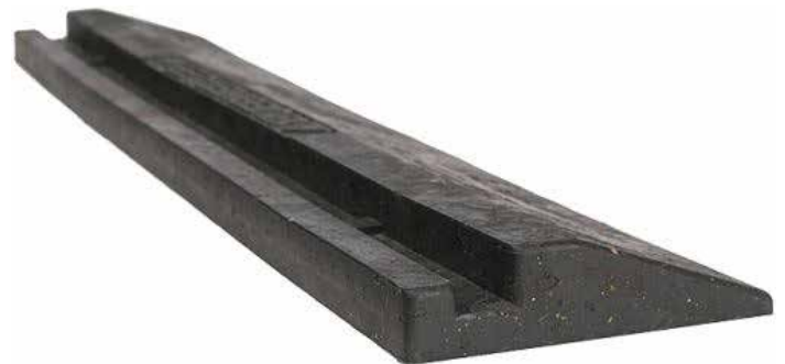
MULTIKETT WALKWAY RAMP BOTTOM