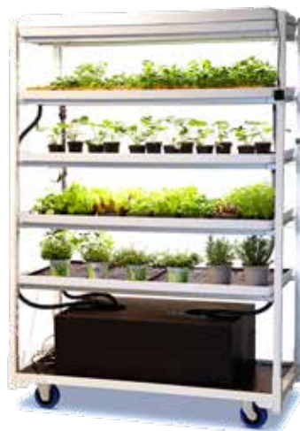
Water tank pump