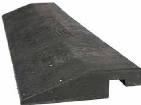
MULTIKETT WALKWAY RAMP TOP