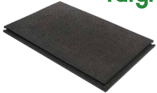
MULTIKETT WALKWAY TILE