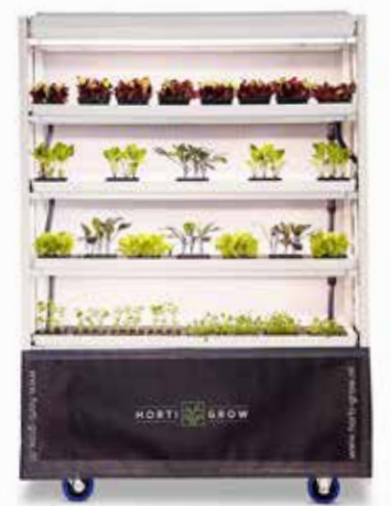
Four growing shelves