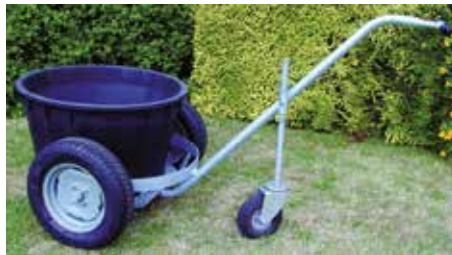
CONTAINER TROLLEY UP TO 75CM DIAMETER POT