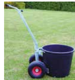
PLANT TROLLEY UP TO 57CM DIAMETER POT