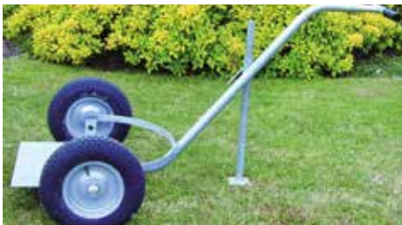
CONTAINER TROLLEY UP TO 50CM DIAMETER POT