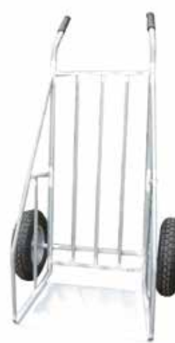
SACK TRUCK UP TO 95CM DIAMETER POT